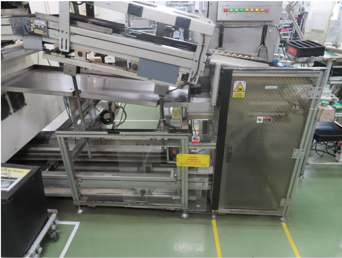
1.SENSBY SOLDE BAR AUTO FEEDER